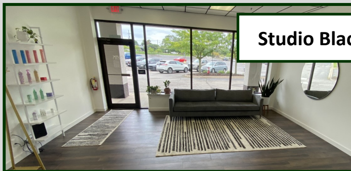
Studio Black Salon