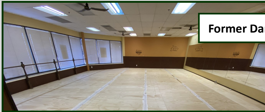
Former Dance Studio